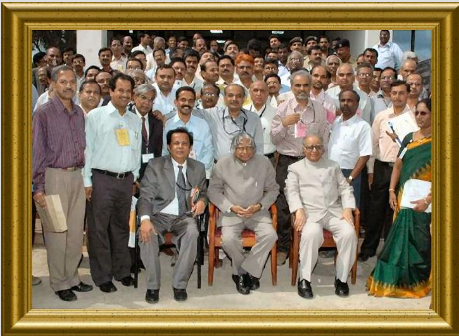
CAPE team got the award from Ex-President, Dr A.P.J. Abdul Kalam